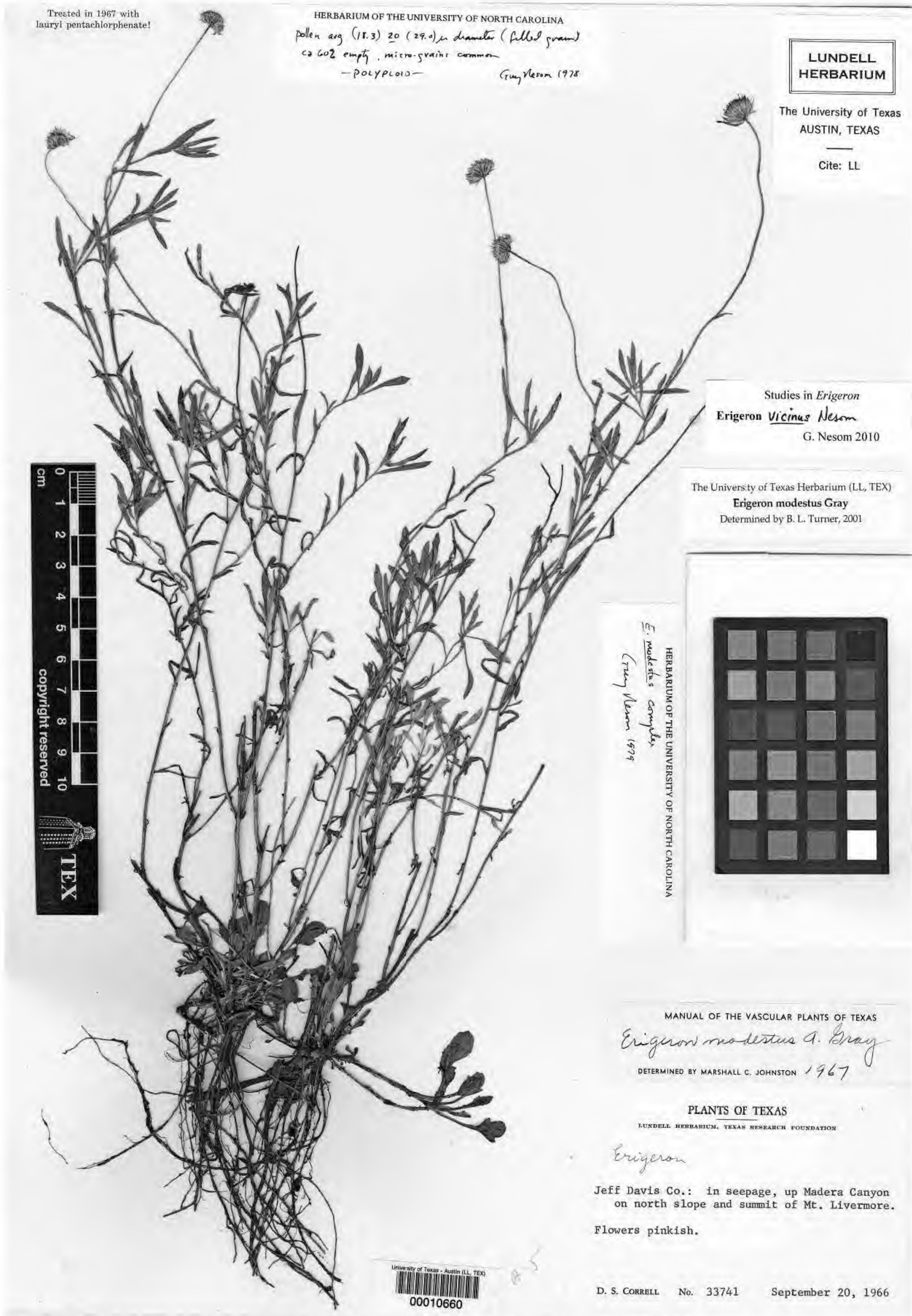
Figure 4. Erigeron vicinus from Jeff Davis County, Texas (Correll 33741).